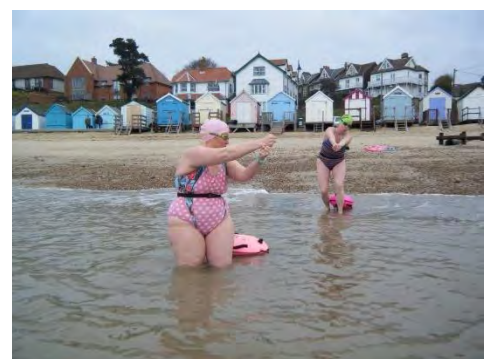
Multi directional polka dots with one direction flamingo print accents