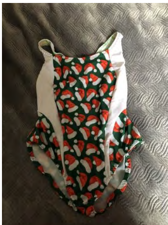
One direction print with solids

This is an example of a multi-way print – you can turn the fabric whichever way you like and the pattern still works and flows correctly. Although remember to stay on the grain of the fabric as directed by the pattern you are using.